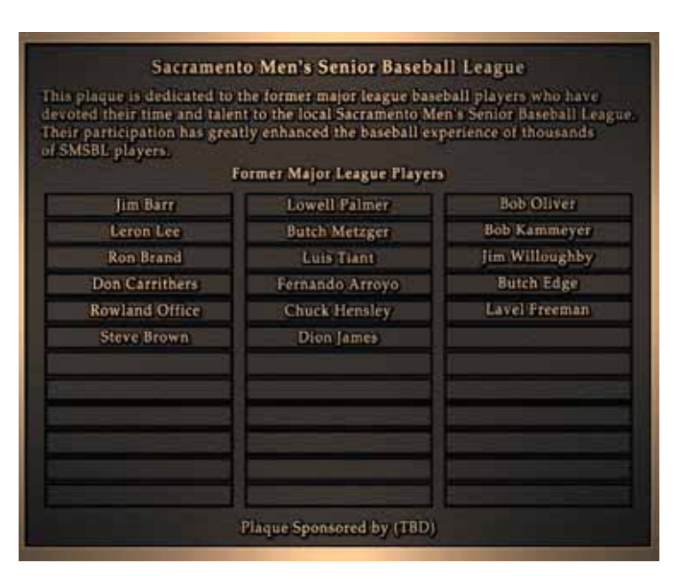
Major League Player Plaque