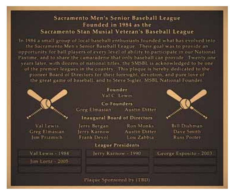
League Founder Plaque